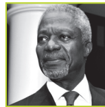
Kofi Anan Advisor