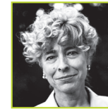
Gesine Schwan President