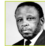
Festus G. Mogae Advisor