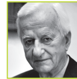
Richard v. Weizsäcker Advisor