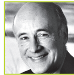
Joseph S. Nye Advisor