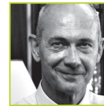
Pascal Lamy Advisor